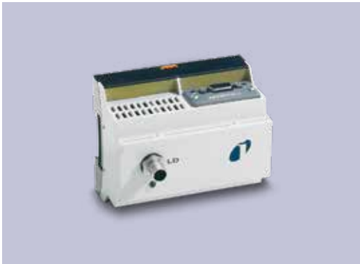
BM1000 BUS MODULE