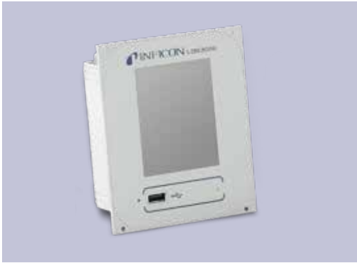
CU1000 CONTROL UNIT